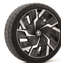
20" 'SAGITARIUS' Alloys

ŠKODA reserves the right to make changes to specifications, colours and prices without notice. Whilst we make every effort to ensure that specifications are accurate at the time of publication, you should always check with your ŠKODA dealer for the latest information.