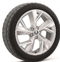
19" 'TRIGLAV' Alloys