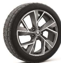
19" 'TRIGLAV' Black Alloys