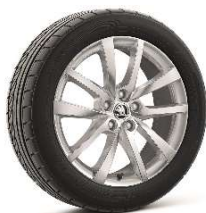
18" 'ELBRUS' Alloys