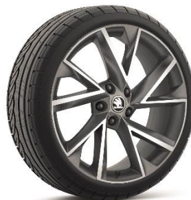
19" Vega alloy wheels