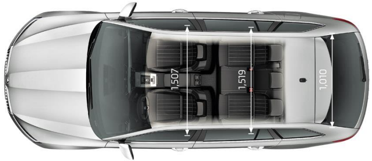
Technical drawing shown is Superb Style