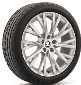
18" Antares alloy wheels